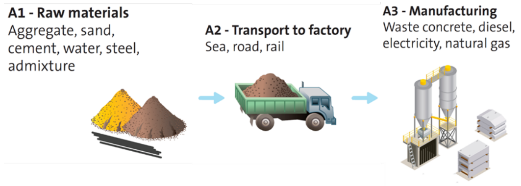
Figure 1 – Cradle-to-gate (A-A3) life cycle stages of precast concrete products